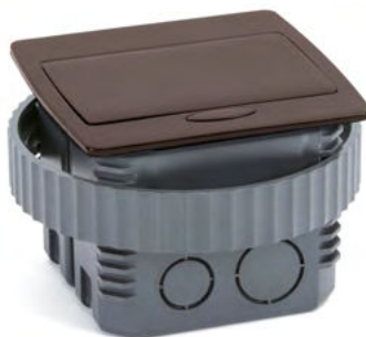
Dark Bronze (PUFP-CT-DB-DS-PB)