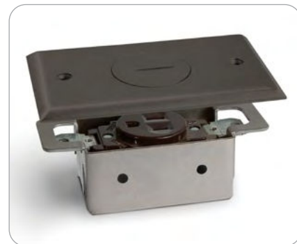
Dark Bronze (RRP-1-DB)