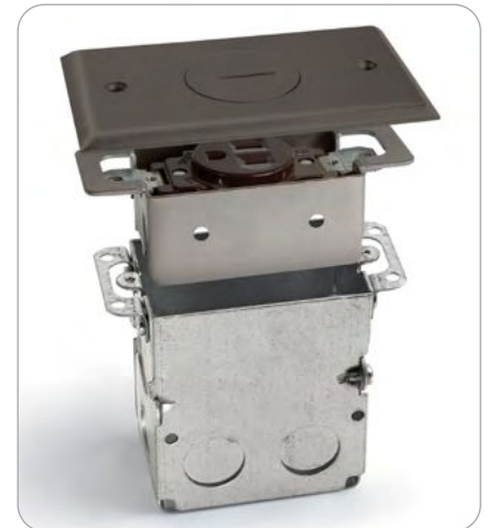
Dark Bronze (SWB-1-DB)