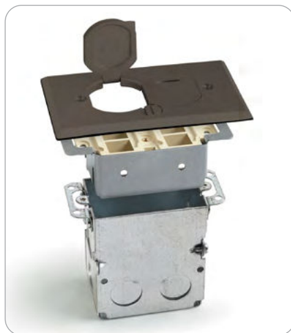
Dark Bronze (SWB-2-LR-DB-T)