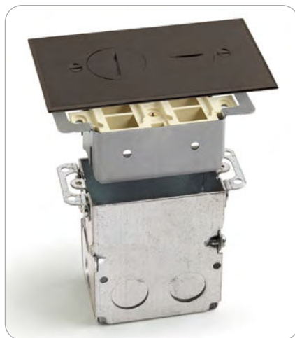
Dark Bronze (SWB-2-DB-T)