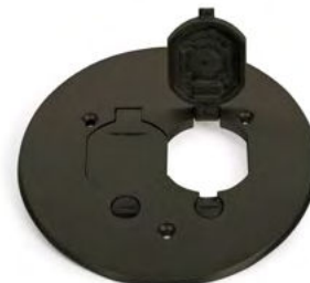
Dark Bronze (TCP-2-LR-DB)