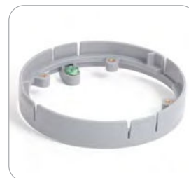
RRFB-LRA (for RRFB Series)