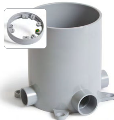
FBLEW (Box + LRA-U)