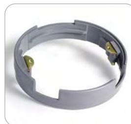
PUFP-LRA (for Round PUFP Covers)