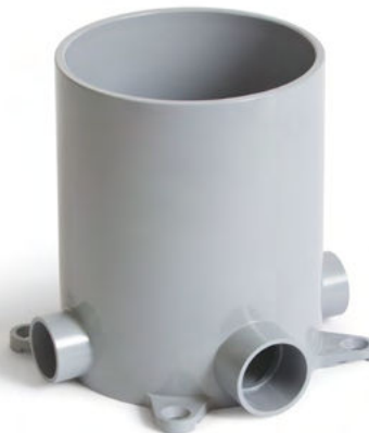
FB (Box only)